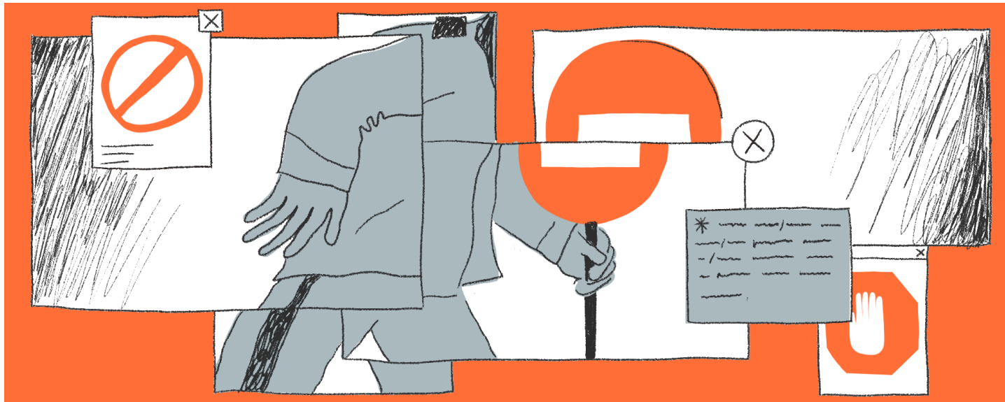
Illustration: Katya Simacheva for OVD-Info